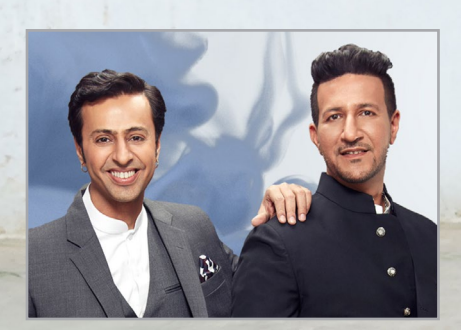
Salim Sulaiman World renowned music composers & performers